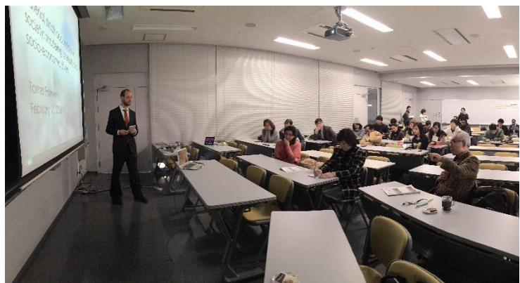
Public Hearing of a Doctoral Dissertation